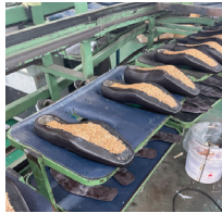
Do cork filler differently?