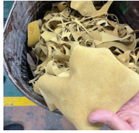
Plan for off-cuts?