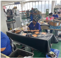
Improve glueing process.