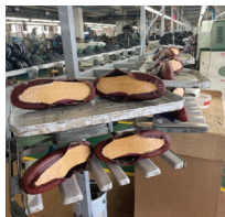
Shoes to be completed at the end of each day.