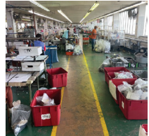
Clear access routes.