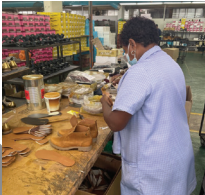
Water base/latex glue?