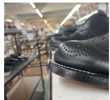
Too much machine pressure.